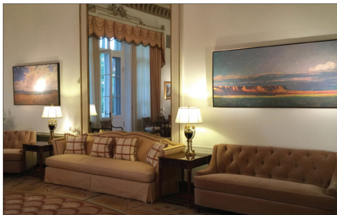
"Late Vermilion Light" (left) and "High Land Summer" (right) hang in the Abassador's residence in Moscow.